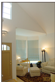
Skylights & Vaulted Ceiling