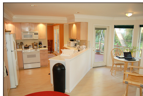
Kitchen & Breakfast Nook